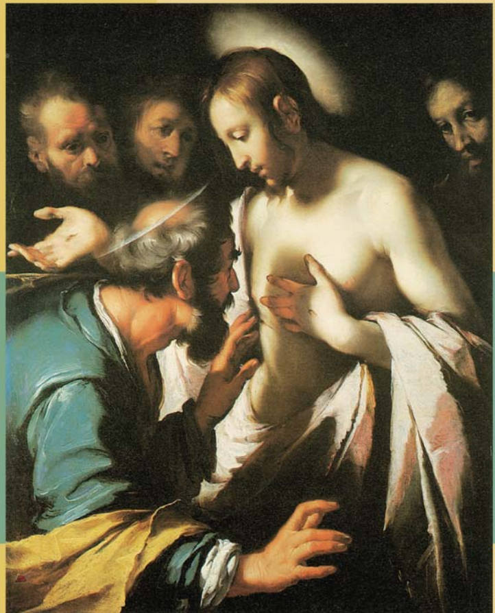
Image of Doubting Thomas by Bernardo Strozzi

Thomas answered and said to him, “My Lord and my God!” - Jn 20:28-29